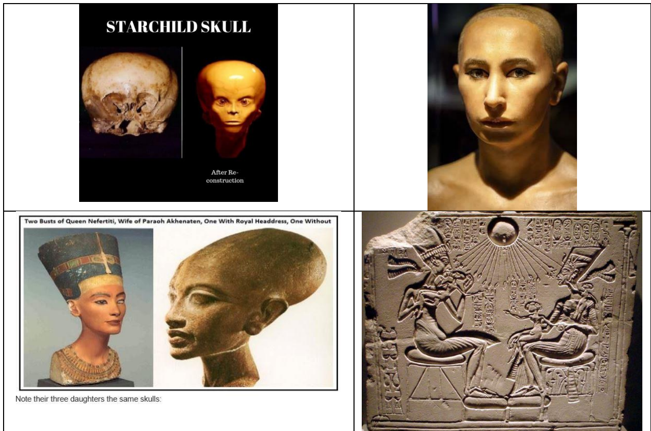
Note their three daughters the same skulls: