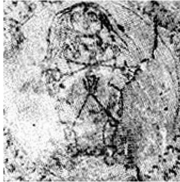
6th century CE incantation bowl (detail) University Museum, University of Pennsylvania

Here is the imagine Lilith within the bowl up close. I love her flowing long hair.